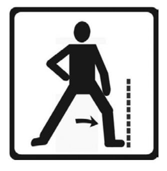
Standing Inner Thigh Stretch